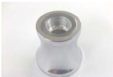
Shift Spacer with spring washer

Step 6: Remove bolt from bottom of shift arm(s) and apply thread locker to threads. Reinstall bolt, but do not tighten yet. Place shift arm into approximate desired position on splined shaft. Being sure to hold the rear shift link at the same time, squeeze the arms towards each other, and tighten the bolt on the shift arm snugly. If you are installing a II Bagger control, this shifter will be used for all shifting, and should be adjusted to enable comfortable up and down shifting. If you are installing a III Bagger series, adjust each arm for heel and toe shifting as necessary, before tightening anything down. On heel/toe shifters, the toe shifter will sit slightly in front of the board, while the heel shift will sit just above the rear of your board to ensure consistent shifting. Once all adjustments are made, tighten completely.